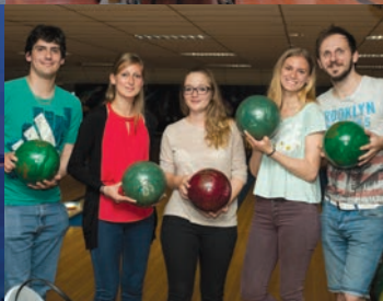
Clockwise from top left: Westbourne staff, Cycling in Bournemouth, Shops, students tenpin bowling, Bournemouth pier at night and Bournemouth ice cream